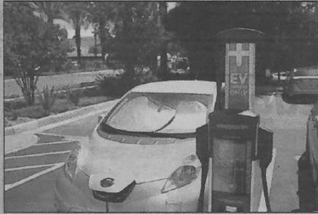
Electric vehicle (EV) charging stations have been installed in Paramount.